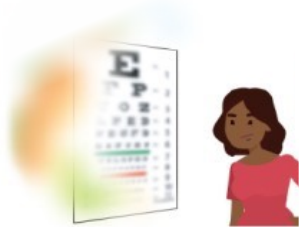
Changes in your vision