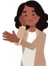
Extreme swelling of your hands or face