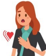
Chest pain or fast-beating heart