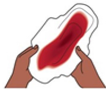
Heavy vaginal bleeding (more than your period) after you give birth

When you reach the office or your OB Provider, tell them: