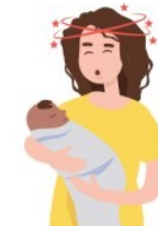
Dizziness or fainting